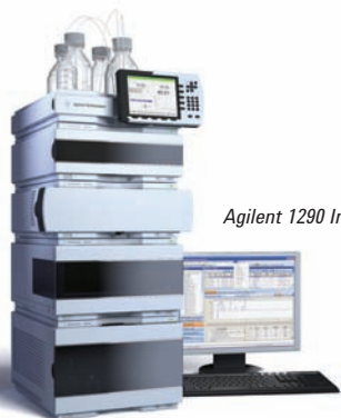
Agilent 1290 Infinity LC